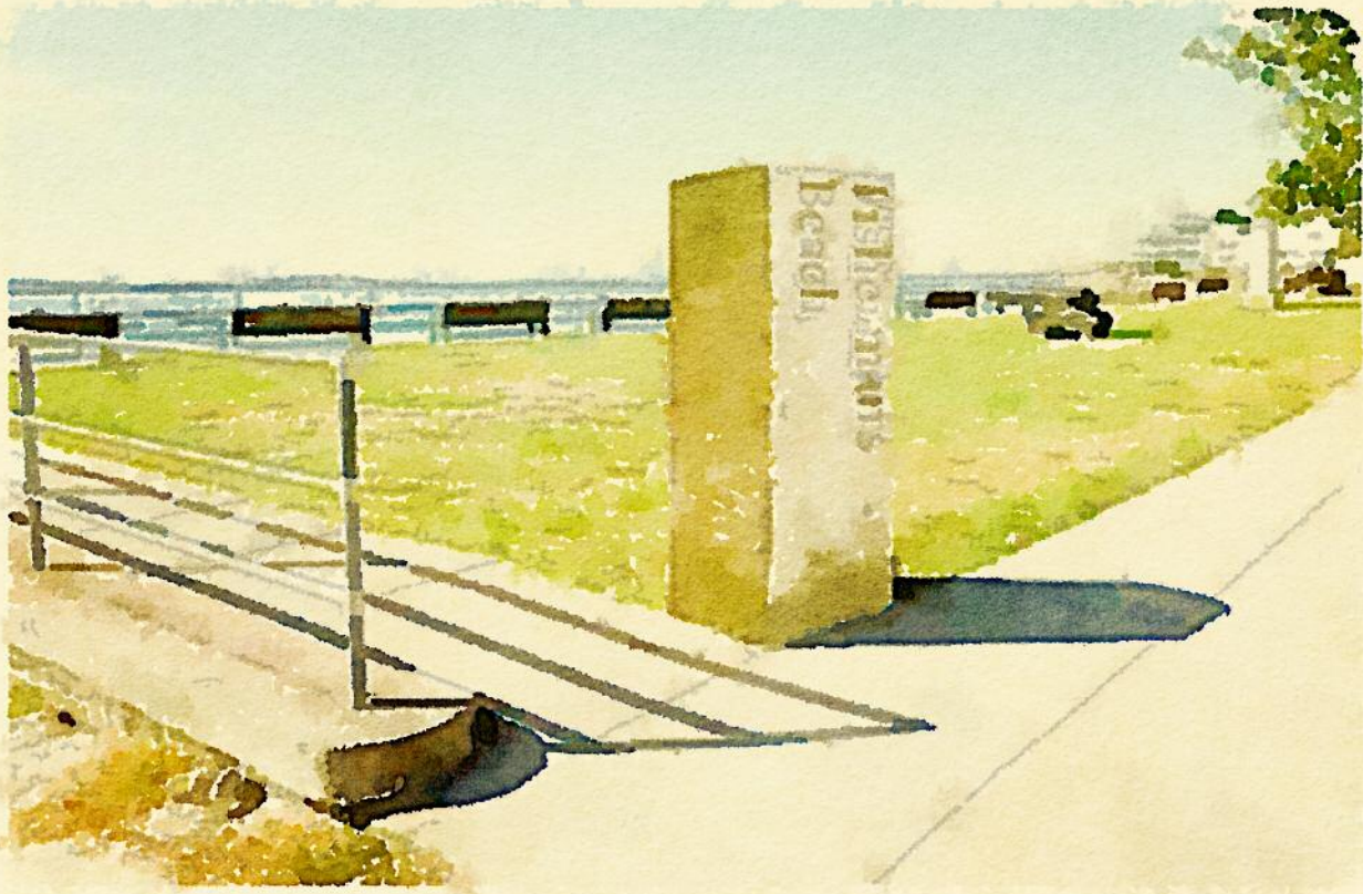
FISHERMAN'S BEACH | JETTY BLOCK