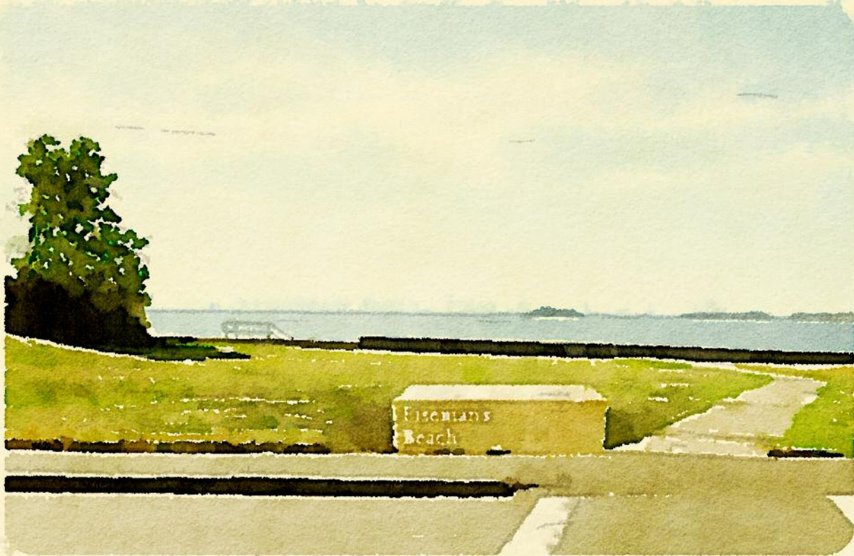
EISEMAN'S BEACH | JETTY BLOCK