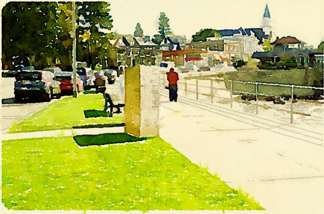
KING'S BEACH | JETTY BLOCK